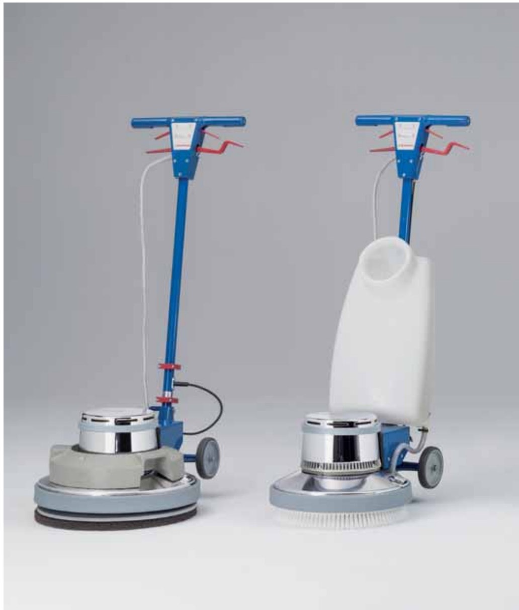
columbus brushes for any application