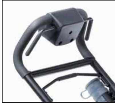
Quick-Stop as standard