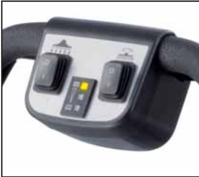
Self explaining control panel