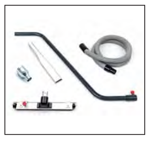
Comprehensive accessories kit for IDV 60