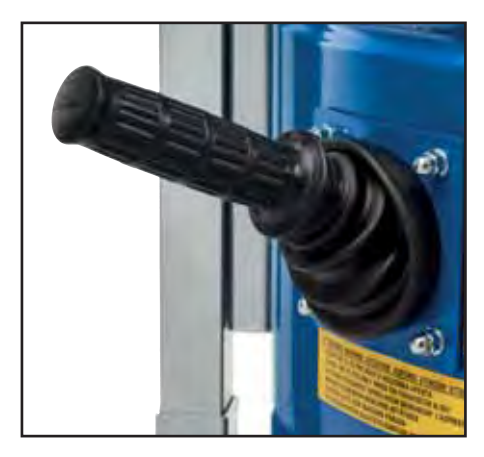
Manual filter shaking to keep suction performance high