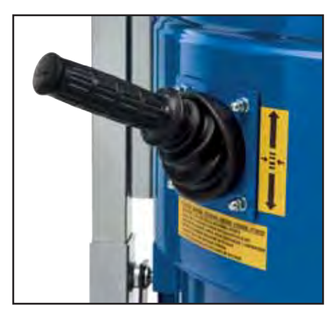
Manual filter shaking for long service life