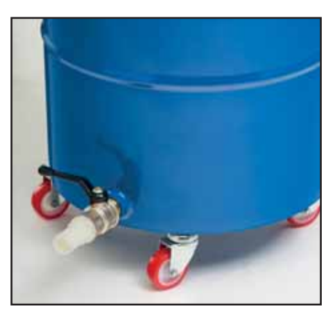
Convenient disposal of cleaned liquids through drain valve