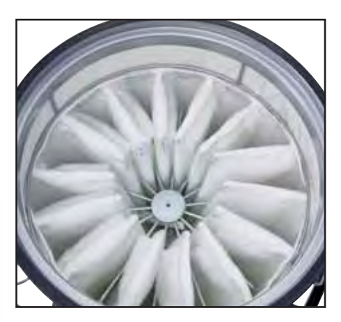
Star filter with 20,000 cm<sup>2</sup> filter surface area