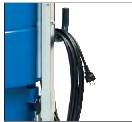
Integrated cable holder