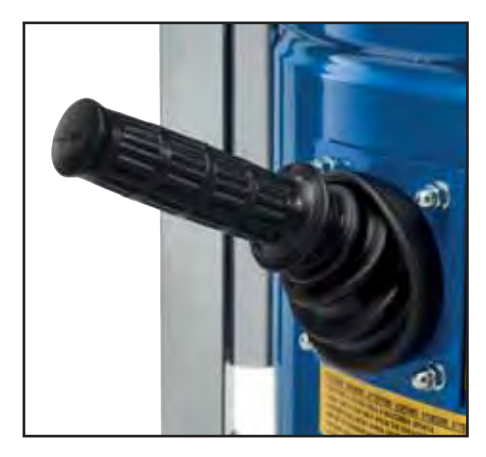
Manual filter shaking to keep suction performance high