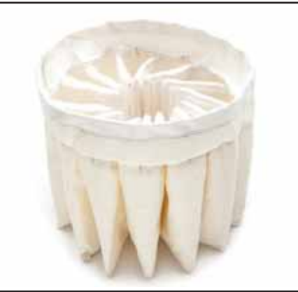
Large star filter made of washable polyester