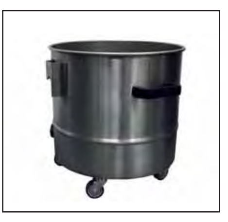
Optional stainless steel container