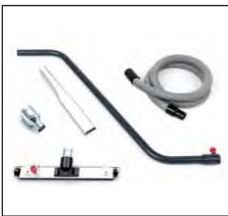
Comprehensive accessories kit for IDV 100