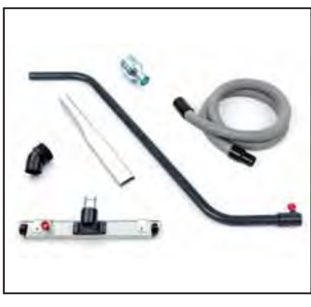
Accessories kit for IWV 80