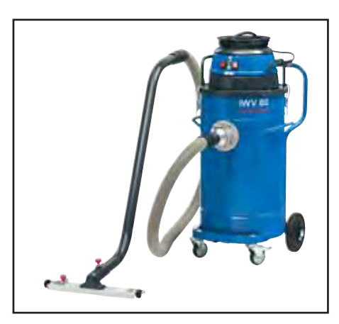
Effective removal of liquids with the floor tool