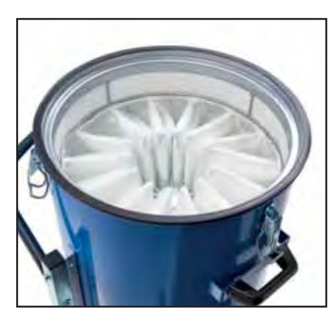
Filter cartridge with 20,000 cm<sup>2</sup> filter surface area