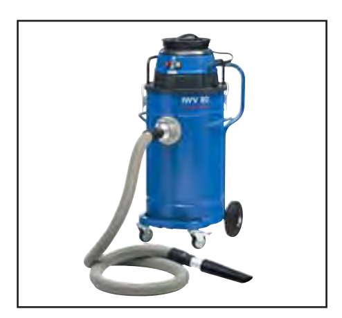
Optional rubber suction tool