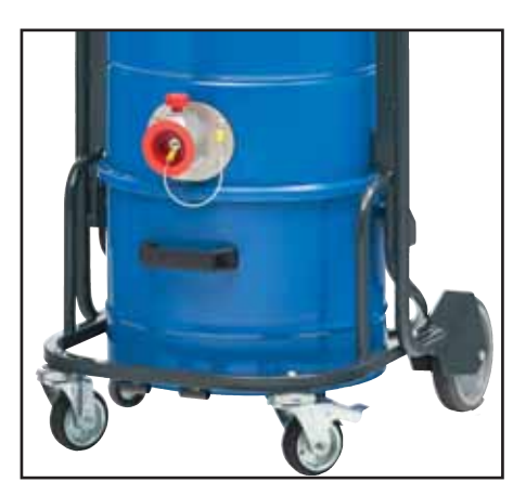
The air flow is diverted to clean the filter.