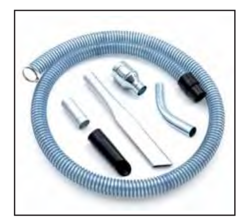
Comprehensive accessories kit for IWV 401100