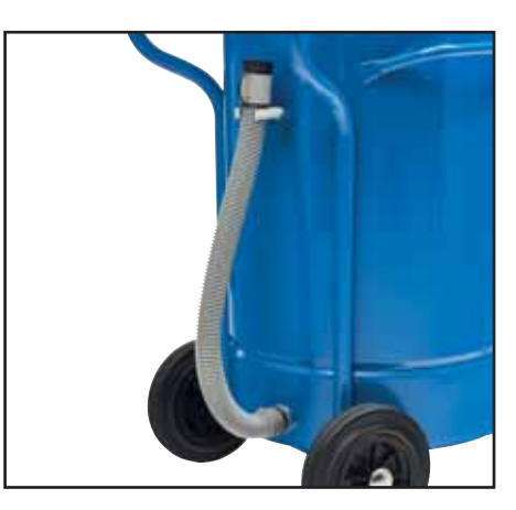
Drain hose from container

• Applications: For various wet applications in virtually all industrial sectors