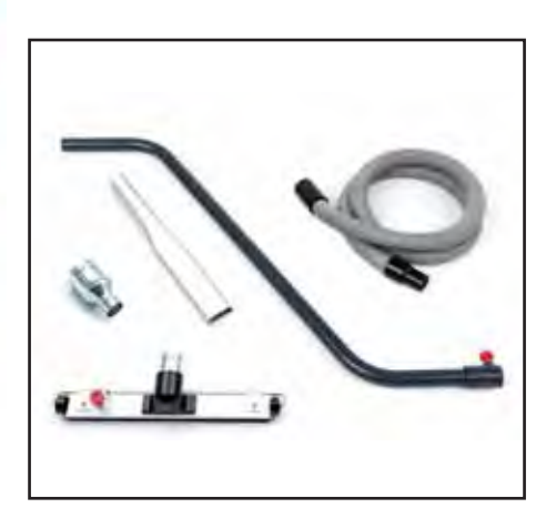
Professional accessories kit for IDV 60 ECO