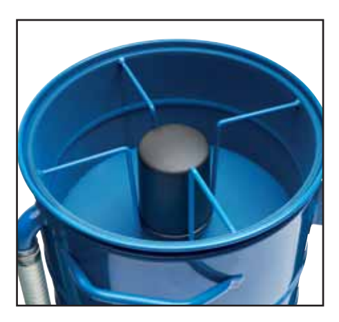
Removable sieve insert to separate liquids and metal chips