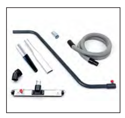
Professional accessories kit for IDV 13