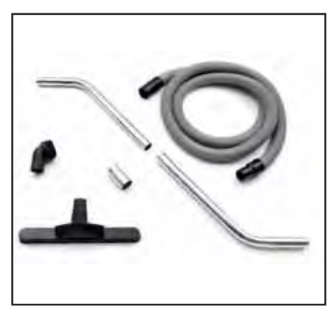
Standard accessories kit for IDV 13