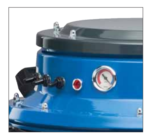
Continuous monitoring of filter clogging with negative pressure indicator