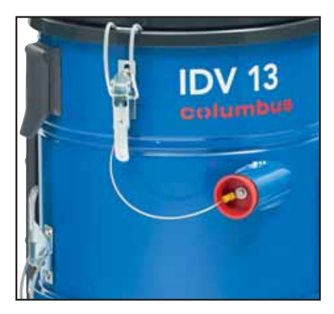
Negative pressure is generated to clean the filter.