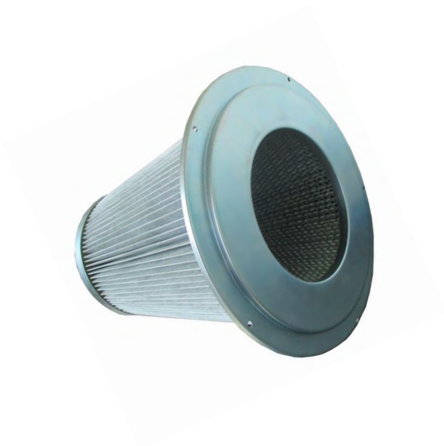
21478400 - D. 340x350H "M" CAT.FILTER CARTRIDGE FILTER