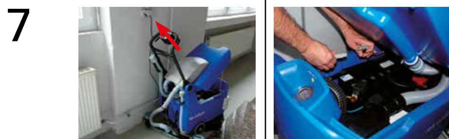
RA 43|B 20 i. L.