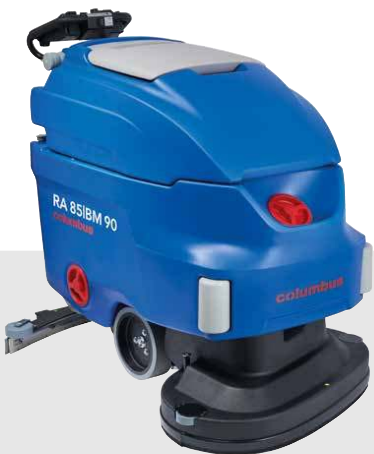
RA 85|BM 90