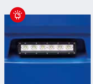
FRONT LED LAMP For optimum visibility (and thus safety) during operation