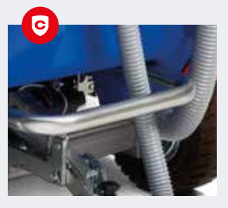
REAR IMPACT PROTECTION Highly resilient steel protection for the rear