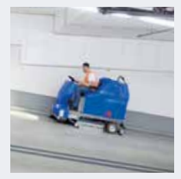
ALL-WHEEL DRIVE For inclines of up to 20 percent. Ideal for parking