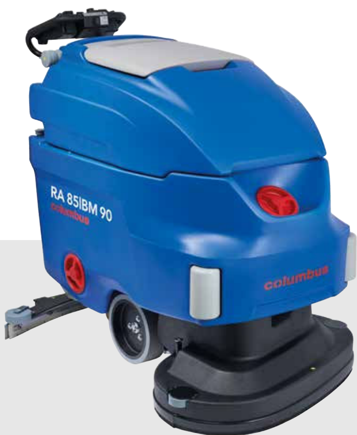
RA 85|BM 90