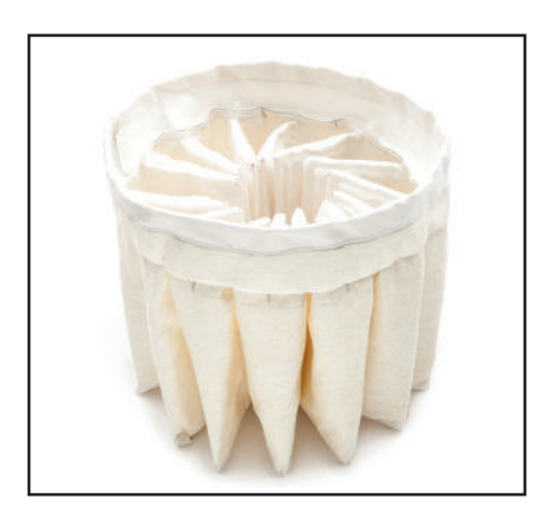
Large star filter made of washable polyester