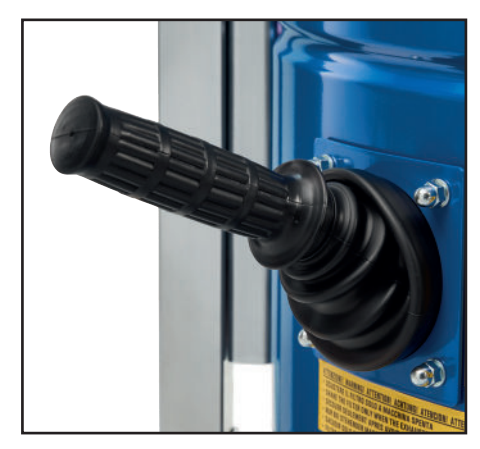
Manual filter shaking to keep suction performance high