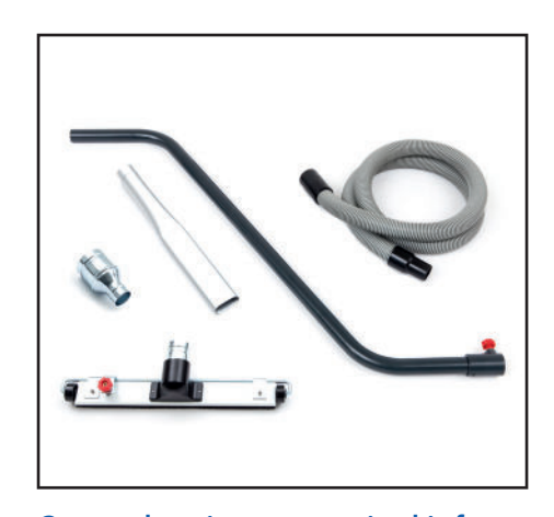
Comprehensive accessories kit for IDV 100