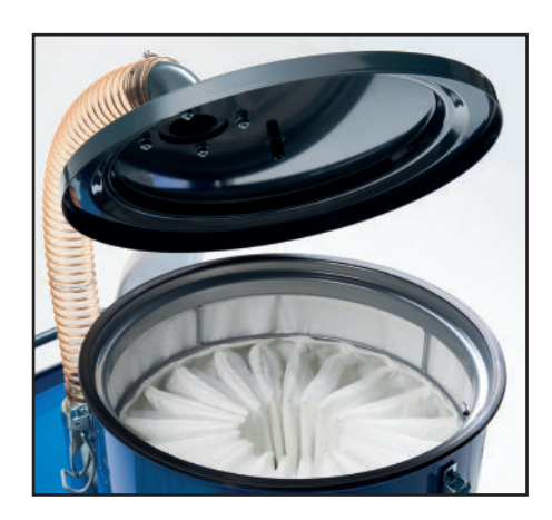
Filter cartridge with 30,000 cm<sup>2</sup> filter surface area