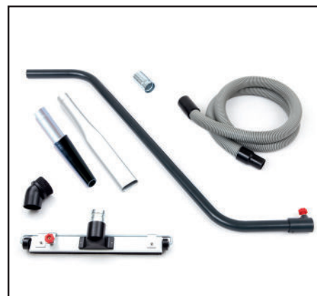
Professional accessories kit for IDV 13