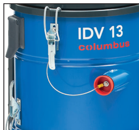
Negative pressure is generated to clean the filter.