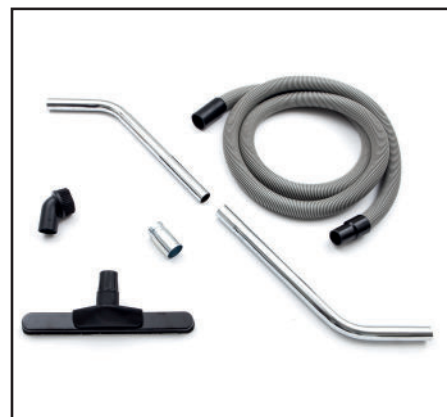
Standard accessories kit for IDV 13