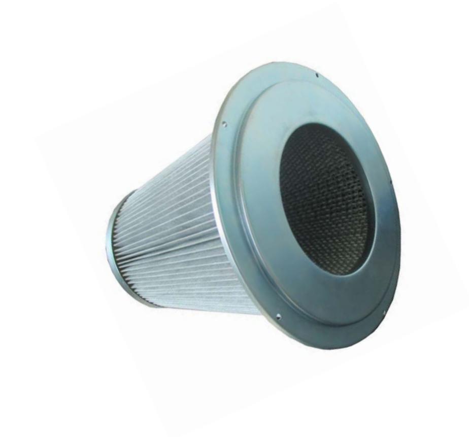
21478400 - D. 340x350H "M" CAT.FILTER CARTRIDGE FILTER