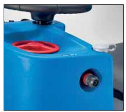
Fresh water service hatch