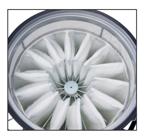
Star filter with 20,000 cm<sup>2</sup> filter surface area