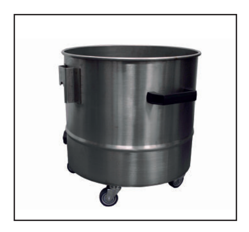
Optional stainless steel container