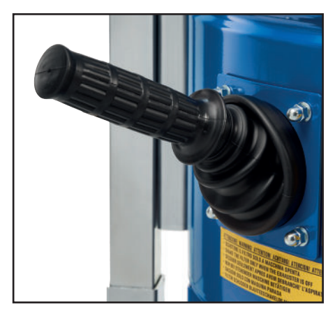
Manual filter shaking to keep suction performance high