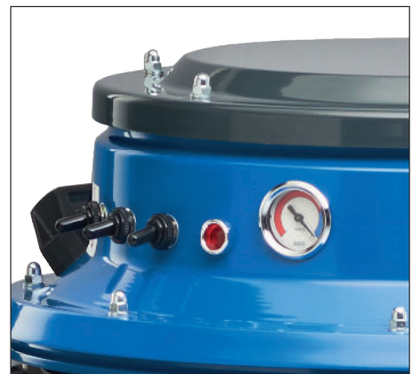
Continuous monitoring of filter clogging with negative pressure indicator