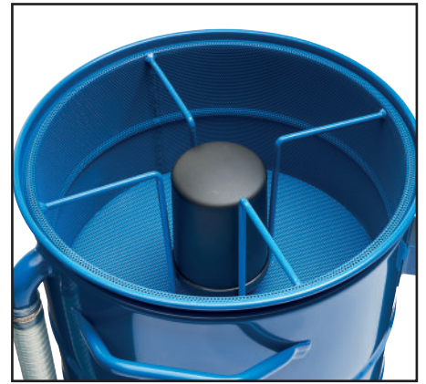
Removable sieve insert to separate liquids and metal chips