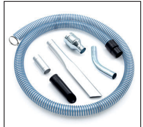
Comprehensive accessories kit for IWV 40/100