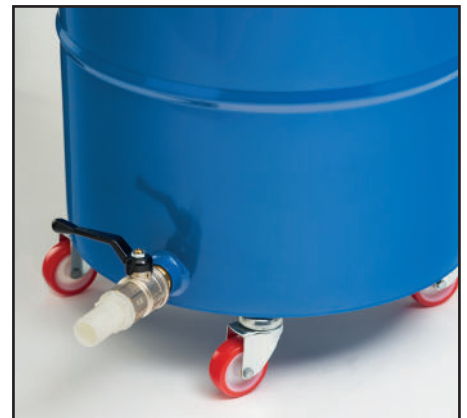
Convenient disposal of cleaned liquids through drain valve