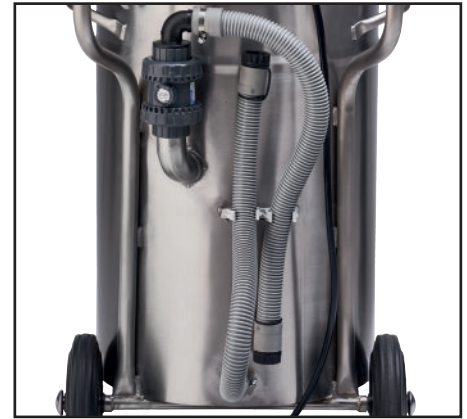
Controlled emptying through drain hose