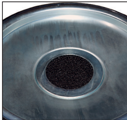
The suction unit is additionally protected by a special sponge filter.