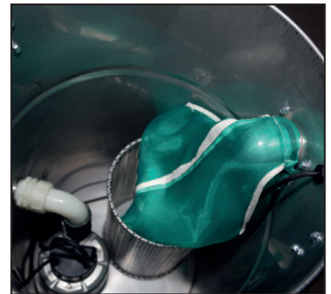
The polypropylene wet filter prevents from foaming and from absorption of solid particles.