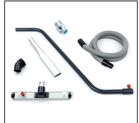
Accessory kit for IWV 80 pump available separately