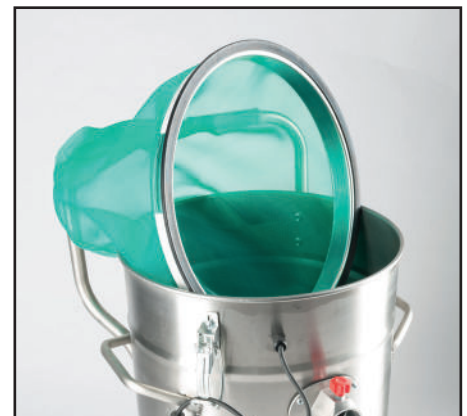
The special wet filter prevents from foaming and from the absorption of solids