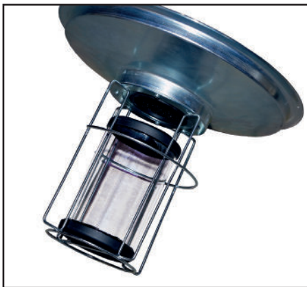
Float of the suction unit