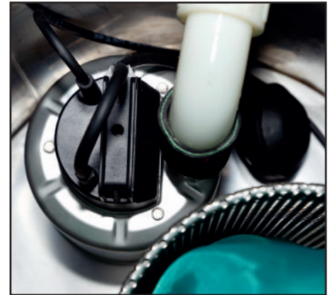
Submersible pump and float