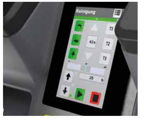
The display module enables freely selectable cleaning cycles and simple digital data management.