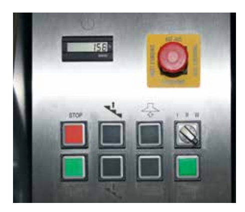
Use the program selector switch to choose between cleaning programs.