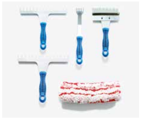
Wide range of special hand cleaning accessories.